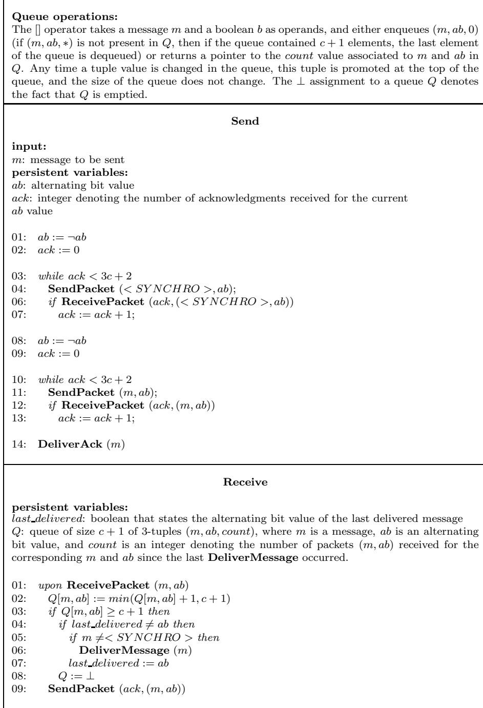
Figure 2: SDL : a (0, 1, 1)-Stabilizing Data-Link protocol